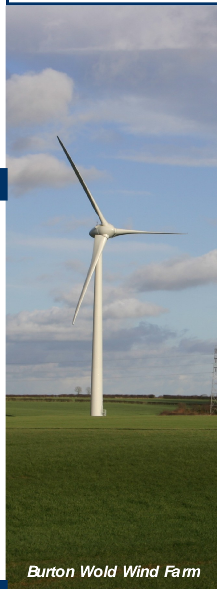
Burton Wold Wind Farm